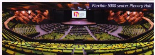
Flexible 5000 seater Plenary Hall