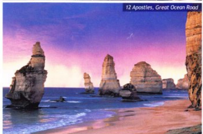
12 Apostles, Great Ocean Road